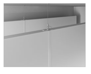
The framed Rockfon Baffles can be suspended using either the Design Suspension Set, the Classic Suspension Set or hangers, perfect for quickly adjusting the height of your baffle.