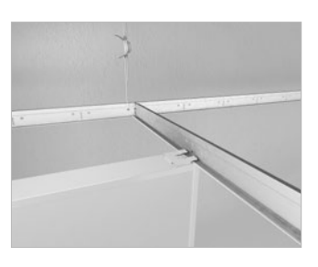
The Rockfon Baffle T24 Solution, which is also available in an ECR version, combines the strength of our Chicago Metallic<sup>™</sup> T24 Grid for a strong connection.