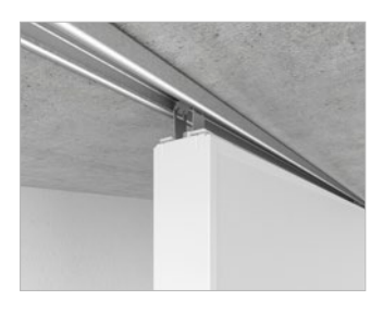
The Rockfon Baffle Support Track Solution is flexible and creates a versatile working space that has an attractive finish with easy alignment.

All of the Rockfon Framed Baffles have our patented multi-functional clip that enables various quick and easy suspension options.