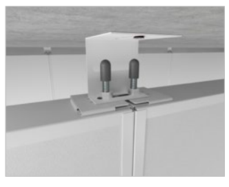
The Rockfon Baffle ECR Direct Fixing Bracket Solution also enables easy alignment and one suspension point for two baffles.